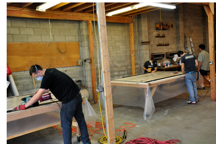
The fabrication arm of Southwell Corp saw significant development in 2009, including taking on projects over $300,000 and many smaller fab jobs.

As of January, 2010, Southwell is announcing a business consulting service through Southwell Management Corp. This service takes the same principles that have grown the other divisions of Southwell Corp and helps clients to achieve the same kind of top quality performance.