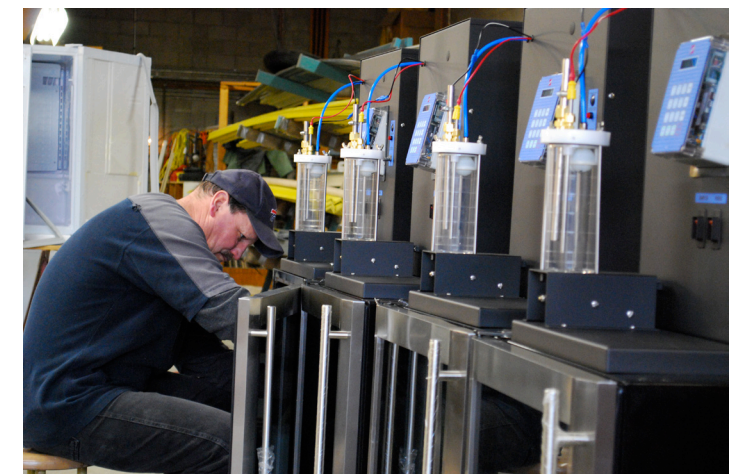
SIRCO Samplers had record sales for 2009. The introduction of new models like the glass-door stationary have been met with tremendous positive response.