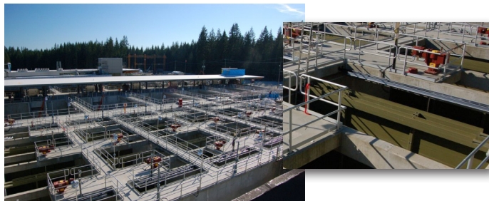
Fiberglass projects have included installing baffle walls for the new Seymour Water Filtration Plant in North Vancouver.

Red Valve/Tideflex sales have doubled over last year, and we have taken on projects with new municipalities.